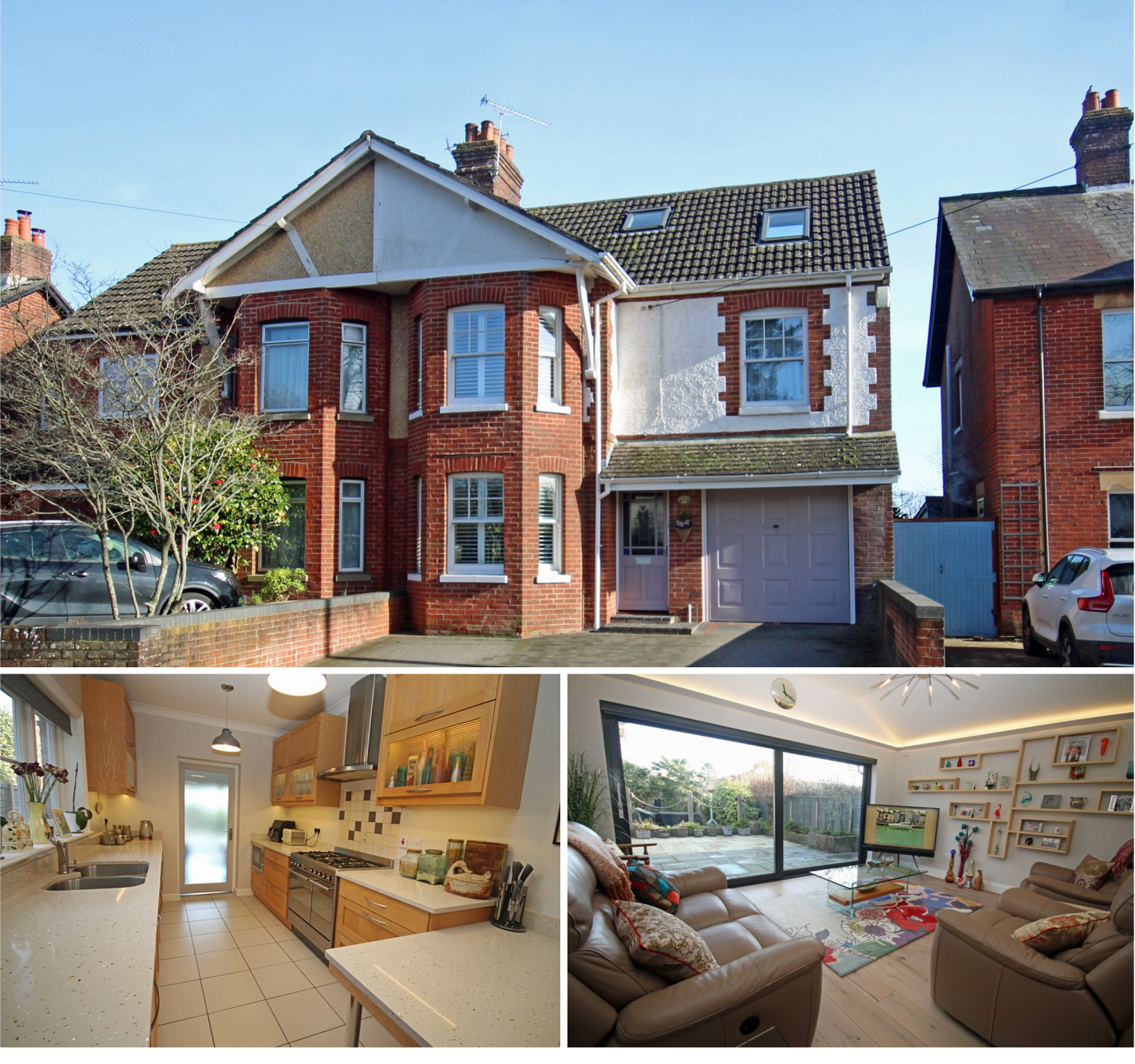
conveniently located for schools, local amenities and main bus route.

Hall, sitting room, dining room, living room, study, kitchen/breakfast room and cloakroom/WC. 4 double bedrooms, 2 shower rooms. Landscaped garden. Garage and parking. GFCH. EPC band D.